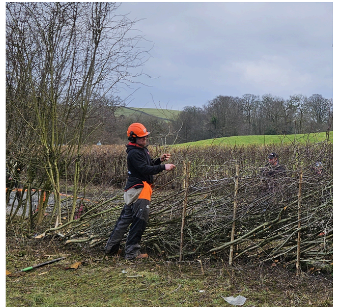
Above: A competitor laying a hedge at our competition