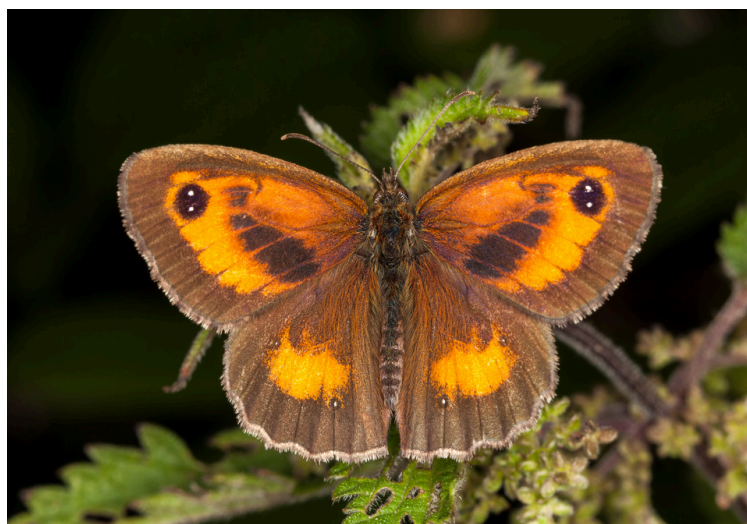
Below: Gatekeeper butterflies are one of many specialist species that rely on healthy hedgerows to survive