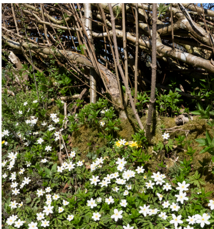
Below: A recently laid hazel hedge with regrowth base