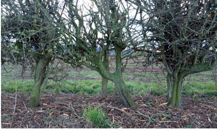
Example of a poorly managed hedge - the lower section is bare!