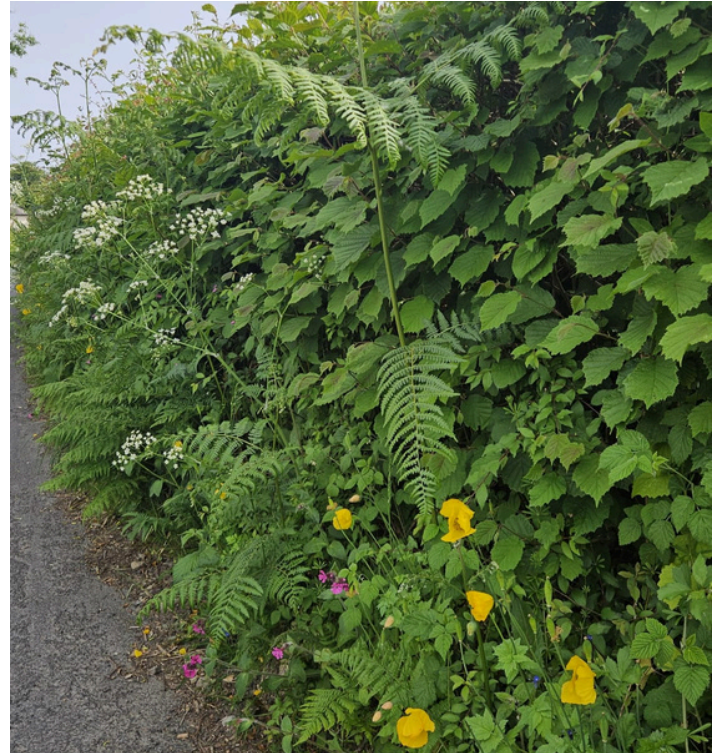
An example of a dense and healthy hazel hedge