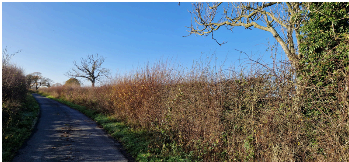
Hedge regrowth where the trim line is visible