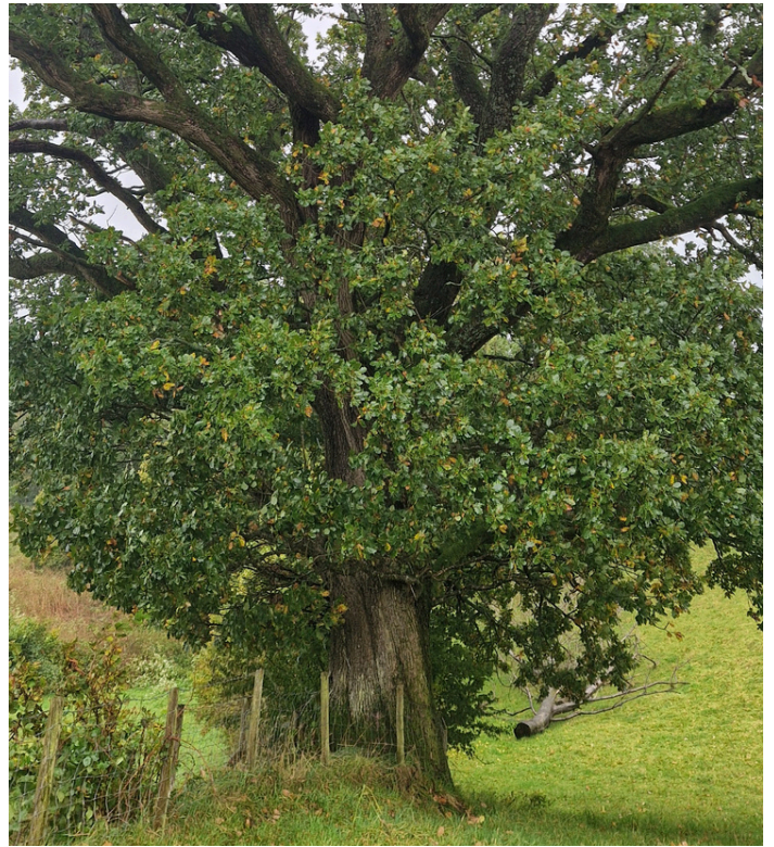
A large mature oak tree inside a hedge